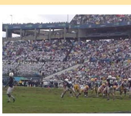
Capital One Bowl