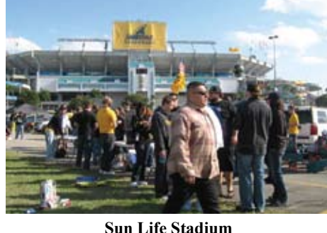
Sun Life Stadium