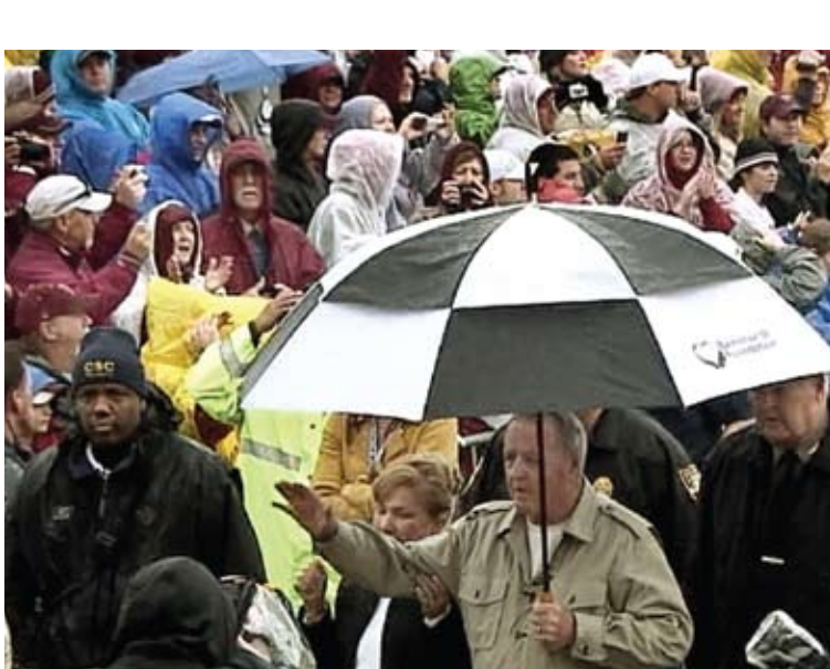
Bobby Bowden bids farewell.